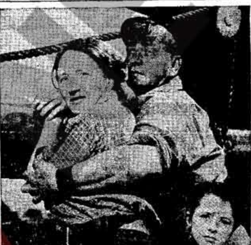
Old Favorites—Wallace Beery appears in one of his popular characterizations, and has the able support of Marjorie Main, in "Barnacle Bill," the State theatre's featured attraction for Sunday and Monday. Here are the stars in a scene from the film, which also features Leo Carillo.