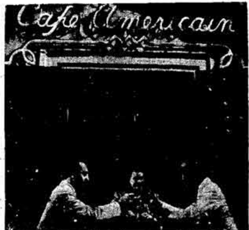
War Front—Into the headlines has come Casablanca, and at the same time there comes to the screen a gripping story of war refugees with this Moroccan city as the colorful setting. Humphrey Bogart, Ingrid Bergman and Paul Henreid are featured in the picture "Casablanca," which is the headline attraction for today and Monday at the Ritz theatre.