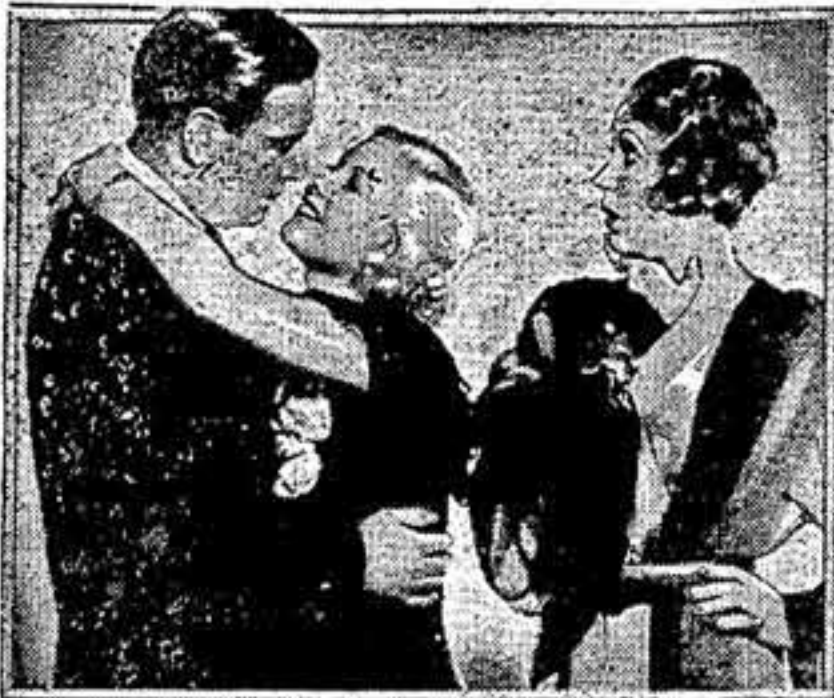
CONWAY TEARLE, MARY CARLISLE and ALICE BRADY in a scene from "SHOULD LADIES BEHAVE"