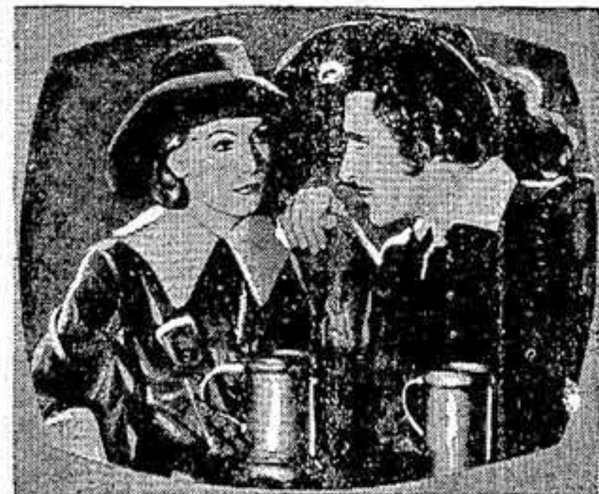
GRETA GARBO and JOHN GILBERT in M-G-M'S "QUEEN CHRISTINA"