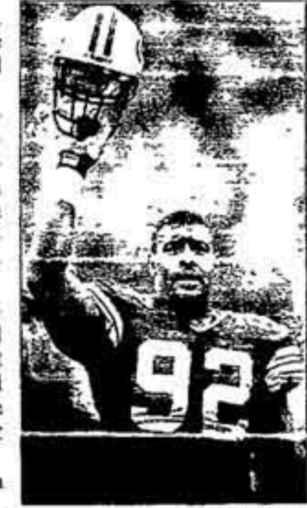
REGGIE WHITE acknowledges the crowd at Lambeau Field in Green Bay after a Packers victory in 1995. White may have died in his sleep on Sunday. An autopsy will be performed to determine the cause of death.

After an All-American senior season in 1981, White was selected to the Pro Bowl a record