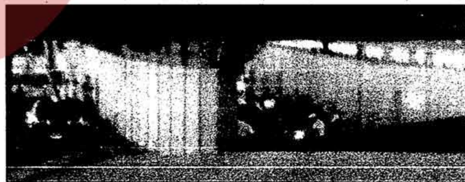
DEATH SCENE: The car in which Diana was riding can be seen in the right tunnel.