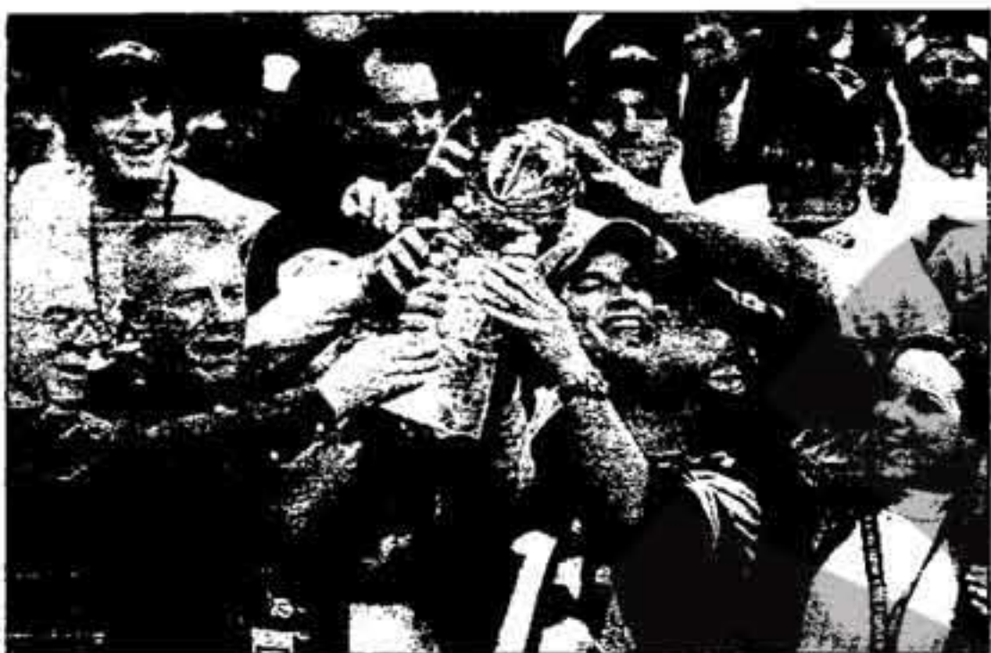
Patriots fans hold the Vince Lombardi Trophy on Sunday in Reliant Stadium in Houston.