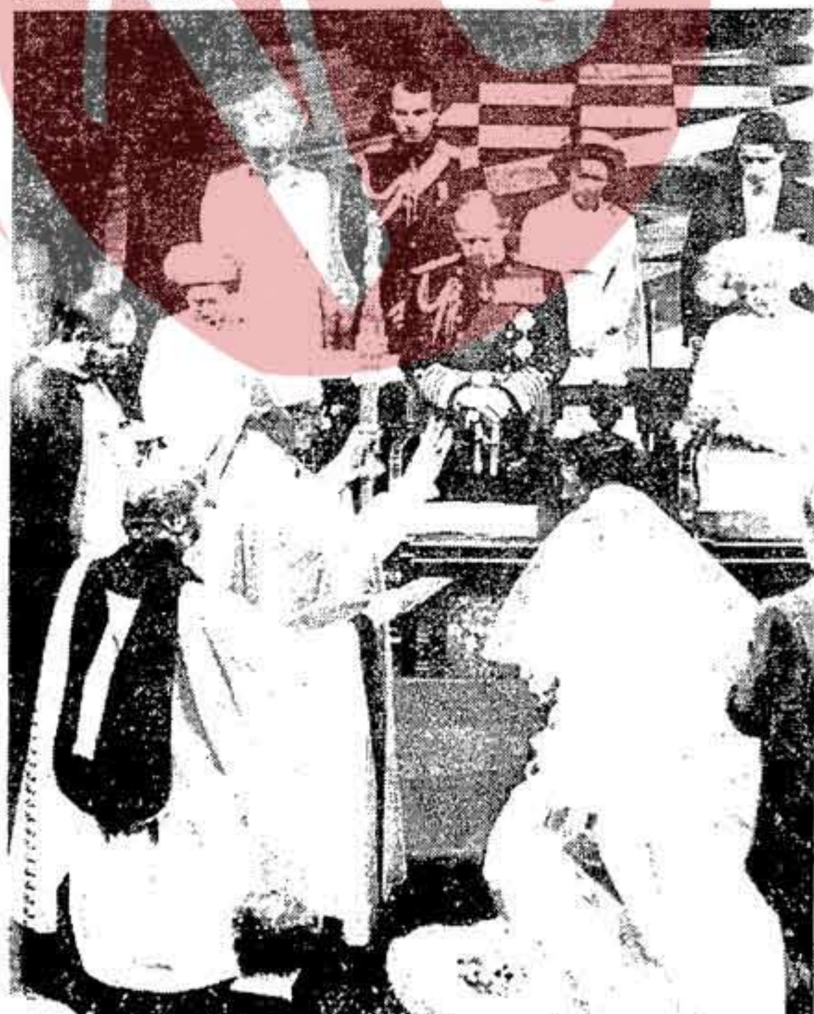
The Archbishop of Canterbury, Dr. Robert Runcie, blessing Prince Charles and Lady Diana at the wedding service in St. Paul's Cathedral. Others in the photo are the Queen, Prince Philip and the Queen Mother. In the background are Princess Ann and her husband Mark Phillips, Princess Margaret and her son Viscount Linley.

Mrs. Reagan was to attend a reception tonight given by British Foreign Secretary Lord Carrington. She is to fly back to Washington tomorrow aboard the U.S. government aircraft which occasionally serves as Air Force One, ending her first overseas trip since moving into the White House and the longest separation from her husband in their 29-year marriage.